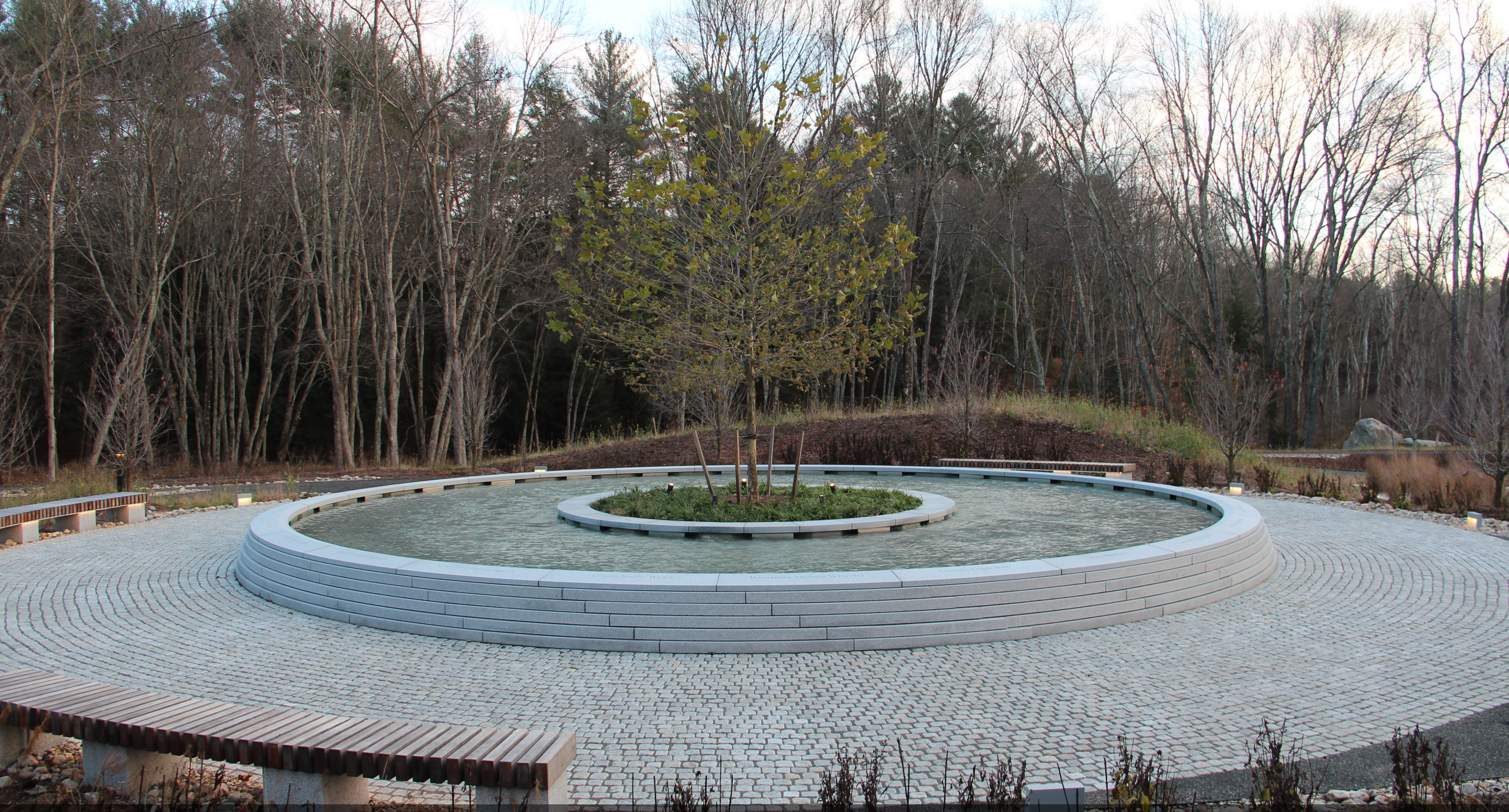
The permanent Sandy Hook Memorial